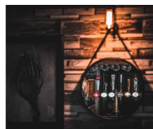
Venue for Hire